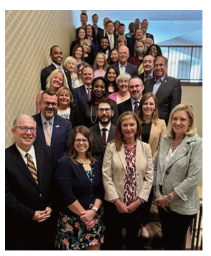
Participants in the JCPP meeting, September 2023

ACPE Staff welcome the opportunities to hear from our various stakeholders through these types of meetings.