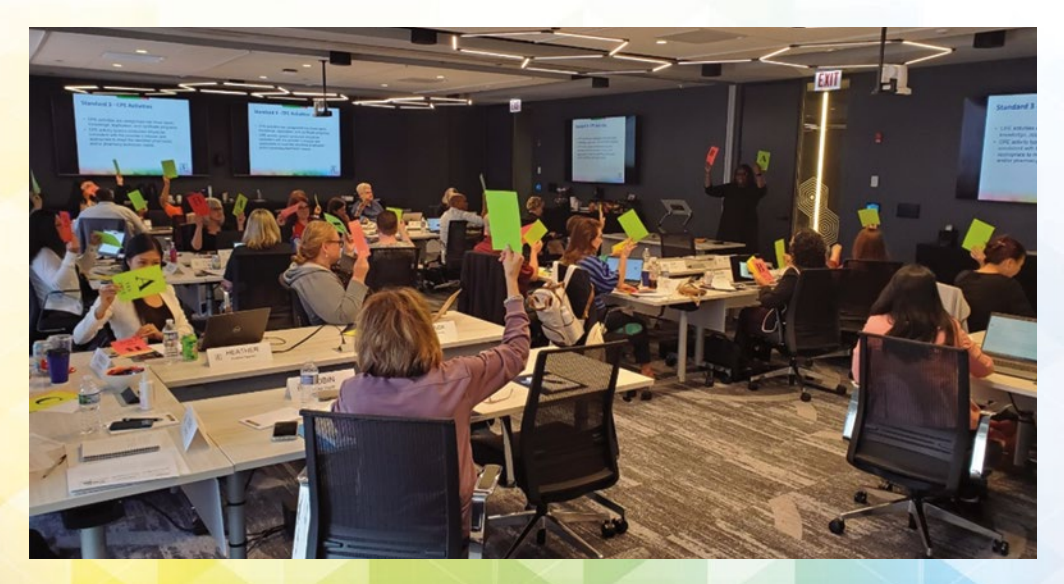
Live CPE Administrator Workshop at the ACPE office

ACPE consistently provides workshops annually for CPE Administrators, offering both virtual and an in-person option. Stay tuned for educational opportunities for 2024!