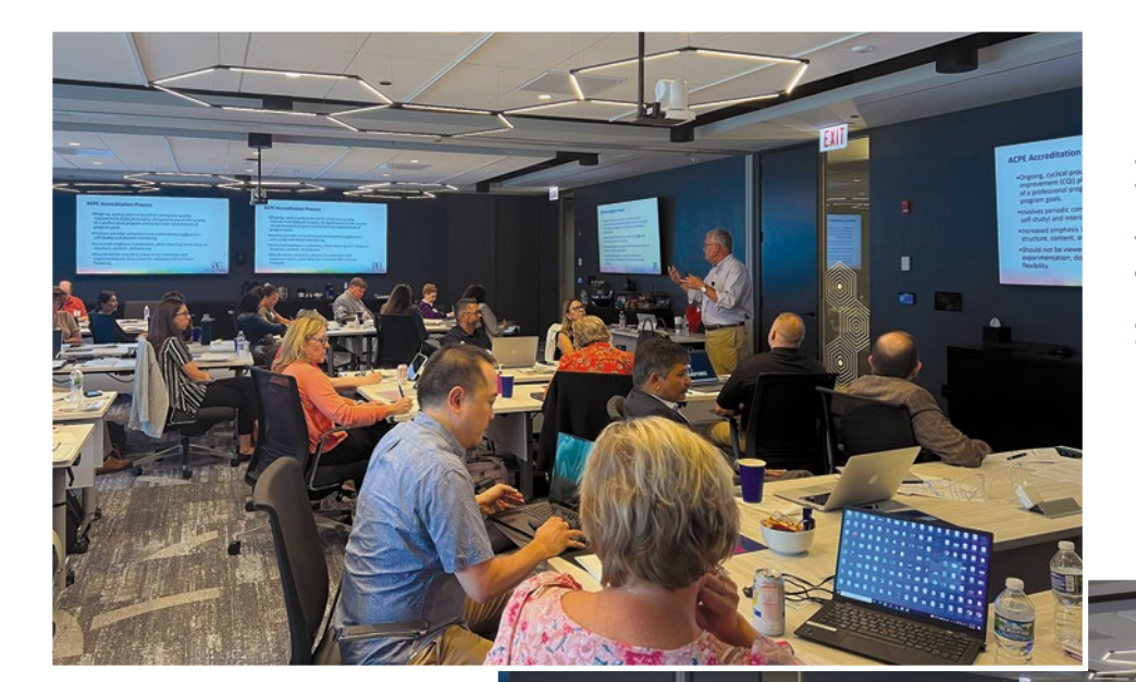
Participants and ACPE Staff together again for live training.

ACPE hosted two College and School training events in the conference facility within ACPE's office suite. ACPE Staff hosted a self-study workshop for Dean and Self-study Chairs. The workshop is intended to assist programs in launching and conducting a successful process of self-reflection on how the program complies with ACPE's accreditation standards. ACPE offers this workshop each August for those programs beginning their self-study. ACPE Staff also hosted a two-day evaluator training workshop. This workshop trains and prepares new site teams members on expectations and preparation for on-site visits.